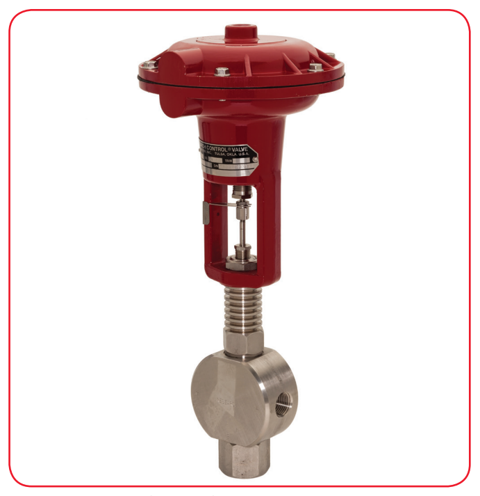
Shown with type 755 actuator